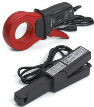
Illustration shows high performance current probes from Tektronix Inc.

Normally the probe provides a method of mechanically splitting the magnetic circuit to enable the conductor to be inserted. The position of the conductor within the loop has relatively little effect upon the measurement.