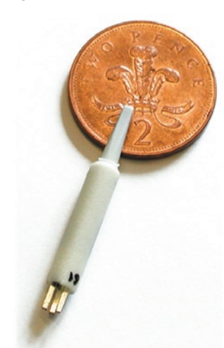
The illustration shows the main part of the magnetometer. The field sensing element is of sub-millimetre dimensions and is placed at the tip of the sensor.

This enables it to use an excitation frequency of several tens of MHz resulting in a sensor with a bandwidth of dc to 5MHz combined with low noise and wide dynamic range.